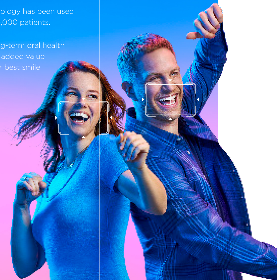
SureSmile treated cases- data on file 2021.

Invest in your long-term oral health and discover the added value that flashing your best smile can provide.