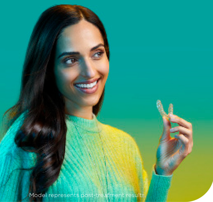
Model represents post-treatment results.